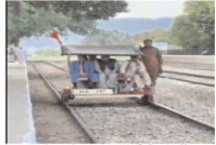
operational aspects of the railway system.

The Divisional Superintendent (DS) Rawalpindi accompanied the minister during the inspection and provided detailed briefings on various