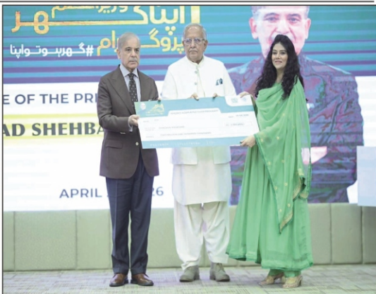
ISLAMABAD: Prime Minister Muhammad Shehbaz Sharif distributes PM Apna Ghar Program cheques among the beneficiaries.