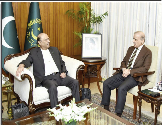
ISLAMABAD: President Asif Ali Zardari in a meeting with Prime Minister Muhammad Shehbaz Sharif at Aiwan-e-Sadr.

The President Secretariat's statement said PM Shehbaz called Zardari at the Aiwan-i-Sadr today, and the latter "appreciated the untiring efforts" by Pakistan in hosting a dialogue between the US and Iran. The president discussed the prevailing security and diplomatic situation in the region, saying that the situation had a "far-reaching impact not only on the region but also on the global security, economy and politics at large", the statement added.