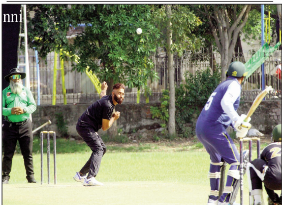
LAHORE: Sardar and Uni Software teams face each other in round matches of Prof Mukhtar Ahmad Butt Memorial Cricket Tournament.

ethical competition. Emphasising the importance of discipline and informed decision-making, she urged student-athletes to uphold the values of clean sport and avoid shortcuts that could jeopardise both their careers and well-being. The interactive session also addressed responsible and informed athletes by promoting anti-doping education and encouraging a culture of fair play. Through such initiatives, the institution continues to support the development of sports alongside character-building and healthy living.