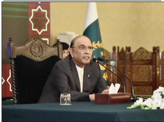
ISLAMABAD: President Asif Ali Zardari addresses the participants of the National Workshop Balochistan-19 during an interactive session at Aiwan-e-Sadr.

The president underscored the importance of unity and internal reflection to address the province's challenges, emphasizing that dialogue and democratic engagement remained the only viable path forward.