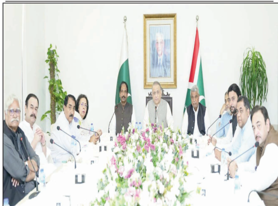
ISLAMABAD: Gilgit-Baltistan Elections; Electoral Board of Istehkam-e-Pakistan Party held meeting chaired by Central President Abdul Aleem Khan.