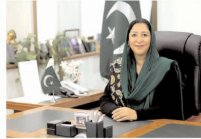
essential qualities for building a responsible and aware society.