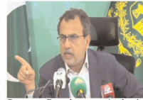
Power Regulatory Authority (Nepra), including its Grid and Distribution Codes.

He directed utilities to immediately discontinue the practice and align all procurement with rules set by the National Electric