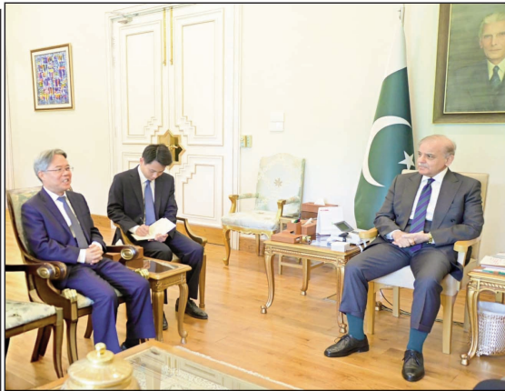
ISLAMABAD: Ambassador of China to Pakistan H.E Jiang Zaidong called on Prime Minister Muhammad Shehbaz Sharif.

The Chinese Ambassador thanked the prime minister for receiving him and expressed China's appreciation of Pakistan's diplomatic efforts.