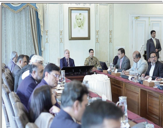
ISLAMABAD: Prime Minister Muhammad Shehbaz Sharif chairs a meeting on promotion of investment.

ment for economic development remained one of the government's top priorities. "The establishment of the Special Investment Facilitation Council (SIFC) has increased investor confidence in the country," the prime minister remarked. During the meeting, participants were briefed on various measures being undertaken to promote investment. It was noted that the share of Special Economic Zones (SEZs) in the country's exports stood at 3.7% during the July-March period of the current fiscal year. The meeting was informed that the government aimed to increase the share of SEZs in exports to 8% by the fiscal year 2028. Participants were further told that a Business-Ready Action Plan was being developed in consultation with the provinces.