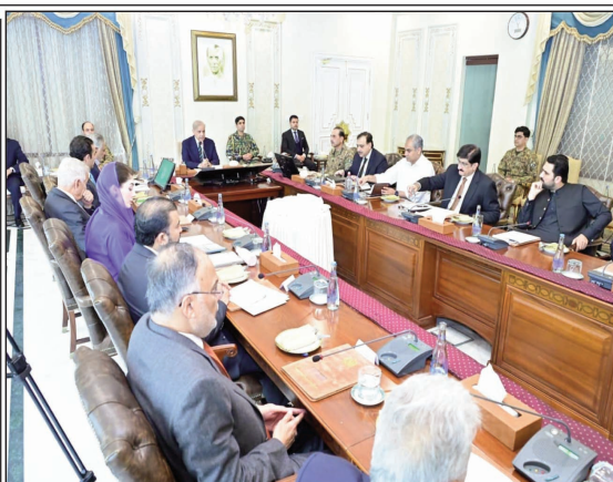
ISLAMABAD: Prime Minister Muhammad Shehbaz Sharif chairs a high level meeting to review austerity measures in the wake of regional situation.

goods and transport. Now we have to set our priorities jointly," he added. He also highlighted the government's initiatives to protect the economy and the common man from the adverse impact of the global oil crisis. In his remarks, PM Shehbaz also said that like other countries across the world, Pakistan was "being severely affected by this war". He added that after achieving macroeconomic stability, the "time for prosperity and development had arrived but unfortunately, as a result of this war, we are facing unlimited economic difficulties". He said two Pakistani vessels that were "waiting to pass through the Strait of Hormuz" were able to do so thanks to the efforts made by Deputy Prime Minister and Foreign Minister Ishaq Dar.