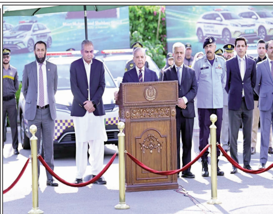
ISLAMABAD: Prime Minister Muhammad Shehbaz Sharif addresses a ceremony of handing over electric vehicles to Islamabad traffic police.

On the occasion, he also congratulated Interior Minister Syed Mohsin Naqvi and his team for taking this initiative. Federal Ministers, Islamabad Police high ups and relevant authorities were present during the ceremony. The provision of eco-smart electric vehicles had been the part and parcel of prime minister's vision and the government's energy saving policy.