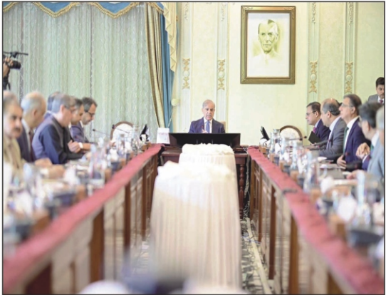
ISLAMABAD: Prime Minister Muhammad Shehbaz Sharif chairs progress review meeting on reforms in power sector.

leniency be shown towards individuals involved in electricity theft. He further ordered strict departmental action against power distribution companies found violating the Economic Merit Order in recent days. He instructed officials to accelerate the implementation of smart meter installation on transformers in areas with high electricity theft and to fast-track measures for promoting a competitive electricity market in the country. The prime minister also directed authorities to expedite work on supplying 400 megawatts of electricity to the private sector in the first phase under the wheeling regime. During the briefing, participants were informed that electricity theft, non-payment, and other losses in distribution companies had significantly decreased.