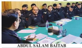
ABDUL SALAM BAITAB

BANNU: In a major operation, police have killed a dangerous suspect, Imran, who was wanted in connection with the murders of five individuals, during an exchange of fire. The suspect was identified as Imran, son of