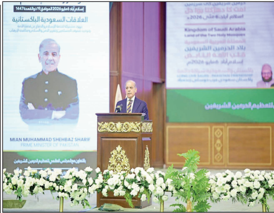
ISLAMABAD: Prime Minister Muhammad Shehbaz Sharif addresses 6th International Paigham e Islam Conference held.