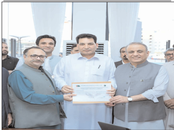
ISLAMABAD: IPP Central President, Abdul Aleem Khan, formally distributed the party tickets to the nominated candidates during a high-level meeting.

Concluding the announcement, IPP Central President Abdul Aleem Khan congratulated all the nominated candidates and extended his best wishes for their upcoming electoral campaigns.