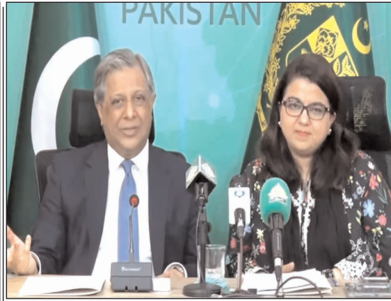
ISLAMABAD: Law Minister Azam Nazeer Tarar addresses a joint press conference alongside IT Minister Shaza Fatima Khawaja in Islamabad on Sunday.

He declared that his government had earmarked 1000 acres for Turkish investors in President Tayyip Erdogan's special economic zone in Karachi. Similarly, in the field of mine and minerals there was great scope, he said, adding, "Now is the time to explore these natural resources through our joint cooperation. Similarly, opportunities existed in the field of artificial intelligence and information technology. Pakistan has a young population. We are a country of 240 million people and 60 percent of it is youth and we wanted to take advantage of their talent." The Prime Minister said Pakistan wanted to privatize its loss-making power sector entities.