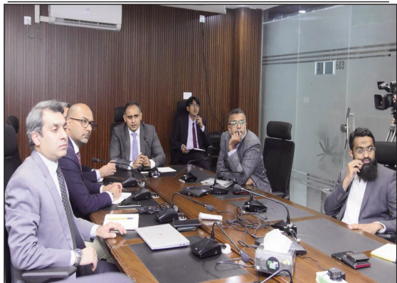
ISLAMABAD: Minister of State for Railways and Finance Bilal Azhar Kayani chaired a high level meeting to assess the on year progress of the Government's Cashless Pakistan initiative at Ministry of Finance.

Despite intense shelling and extremely challenging battlefield conditions, he continued to defend his post until his last breath.