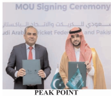
SAUDI ARABIA: Pakistan and the Kingdom of Saudi Arabia on Monday signed a Memorandum of Understanding (MoU) on a new stadium project in Jeddah.