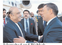
Islamabad and Bishkek.

The visit is of particular significance as President Zardari becomes the first Pakistani head of state to visit Kyrgyzstan since the historic visit of former Prime Minister Benazir Bhutto in 1995. The trip is being viewed as an important step in continuing high-level engagement between