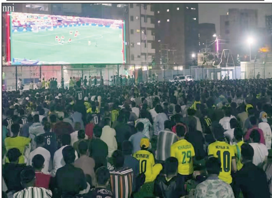
KARACHI: People watch FIFA World Cup match on giant multimedia screen in Lyari Football Stadium here on Monday.

other batters to impress. Sikandar Raza, often a prolific scorer for Zimbabwe, managed just one run before becoming the first victim of Rana, leaving the hosts reeling at 45-4. A 63-run eighth-wicket stand between Ngarava and Nyamhuri offered Zimbabwe a glimmer of figures. The lone fruitful partnership came when Hridoy and Nurul Hasan added 49 runs for the fourth wicket before Hridoy was caught by Ben Curran at deep third off the bowling of Nyamhuri (2-22). Ngarava (3-31) and Brad Evans (3-34) shared the bowling honours for Zimbabwe.