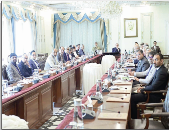
ISLAMABAD: Prime Minister Muhammad Shehbaz Sharif chairs a meeting regarding productive employment for youth.

along with certifications. PM Shehbaz said Pakistani workforce was highly capable and emphasised that the government was taking every possible step to ensure access to international-standard education and opportunities at the global level. The premier instructed relevant institutions to strengthen engagement with different countries to align Pakistani certifications with international standards. The prime minister further ordered that language education, along with certifications, be ensured for countries offering employment opportunities and called for a report on the performance of technical and vocational training institutions as well as the establishment.