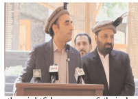
the rightful owners of their land and added that he wished to see representatives from the region sitting in Pakistan's Parliament.

ISLAMABAD: Pakistan Peoples Party (PPP) Chairman Bilawal Bhutto has said that Gilgit-Baltistan and Kashmir will have to be given sovereignty and ownership rights. Addressing the oath-taking ceremony of the newly elected Chief Minister of Gilgit-Baltistan, Bilawal said his political vision centred on securing rights of ownership, governance and employment for the people of the region. Bilawal said the mandate of the people of Gilgit-Baltistan must be respected and that no one would be allowed to undermine their democratic choice. He expressed a desire to help ensure that the residents of Gilgit-Baltistan receive their constitutional rights. He said the people of Gilgit-Baltistan should become