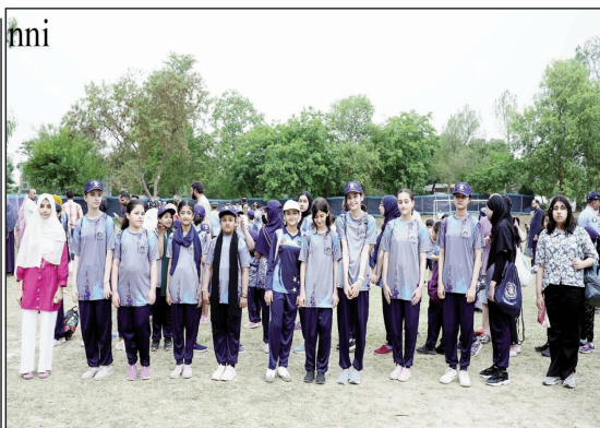
ISLAMABAD: The second batch of the Summer Camp 2026 begins at Police Lines Headquarters, where children will participate in swimming, martial arts, gymnastics, self-defence and other activities aimed at promoting confidence, discipline and a healthy lifestyle.